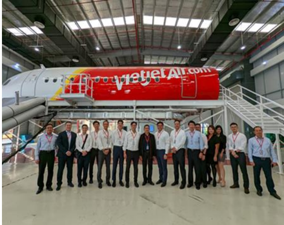
CIECA delegation visited Vietjet Air Academy in Vietnam.